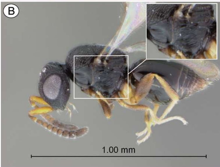
Fig. 2. Comparison of compound microscope versus dissecting microscope using Aphanogmus near goniozi . (a) Leica DRMB compound microscope using a Leica HCX PL "Fluotar" 5× metallurgical grade lens. (b) Leica MZ-16 dissecting microscope lens.

way, setup can be achieved routinely in minutes. The first task is to position the thumbtack stage on the microscope slide. We found that a thin layer of modeling clay on the slide makes an effective, temporary mount for the thumbtack. Finalize the position of the specimen with a stereomicroscope kept adjacent to the compound scope (Fig. 1b); this allows more freedom of positioning compared with the compound scope.